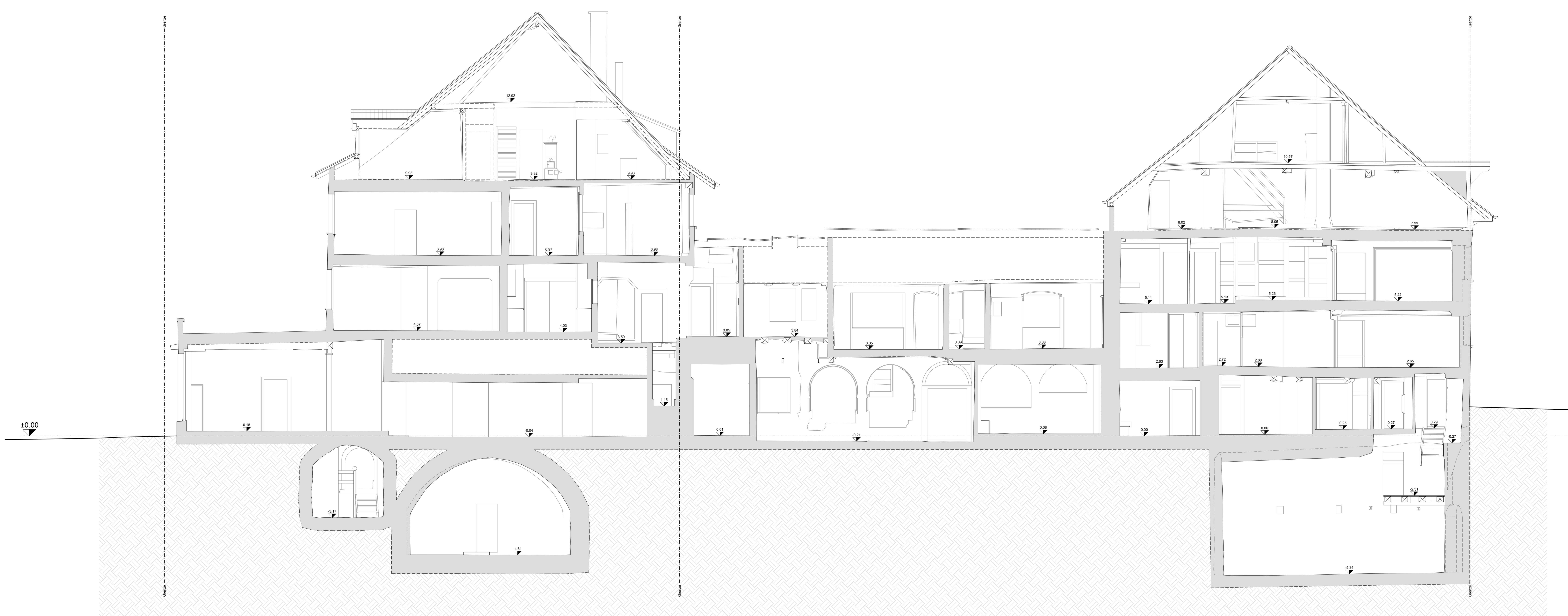
Schnitt B-B M 1:50